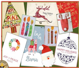
Cards for Veterans