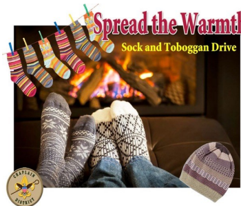
Sock and Toboggan Drive