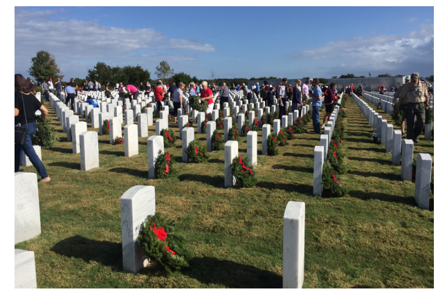
Become a Volunteer Location Coordinator today and help further the mission of Wreaths Across America to REMEMBER, HONOR, and TEACH.