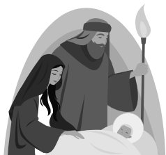
Wesołych Świąt Bożego Narodzenia