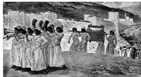
THE SEVEN TRUMPETS OF JERICO. Joshua 6:13. "And seven priests bearing seven trumpets of rams' horns before the ark of the Lord went on continually, and blew with the trumpets."